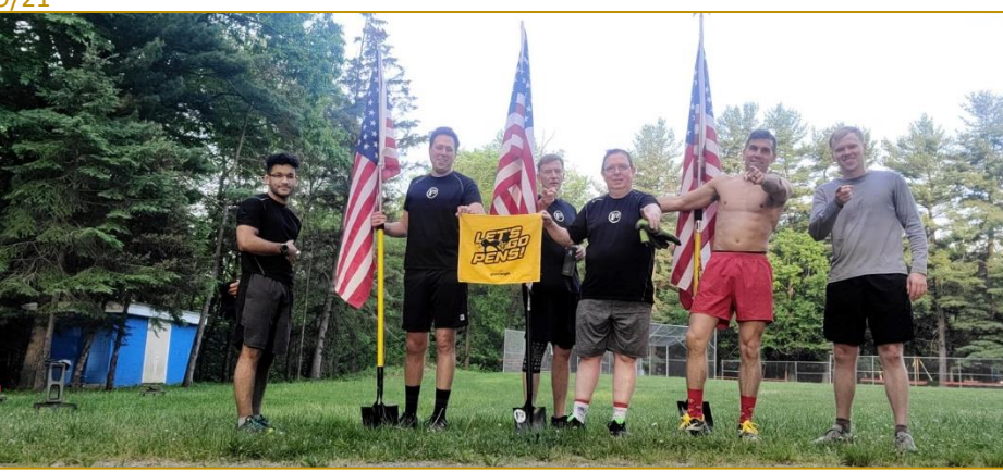
5/22/21 Legion of Gloom

Paper Boy's first post at Pierogi Hill on 5/29/21